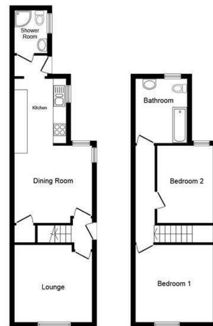
Ground Floor First Floor

Total floor area 79.0 sq. m. (850 sq. ft.) approx This plan is for illustration purposes only and may not be representative of the property. Plan not to scale.